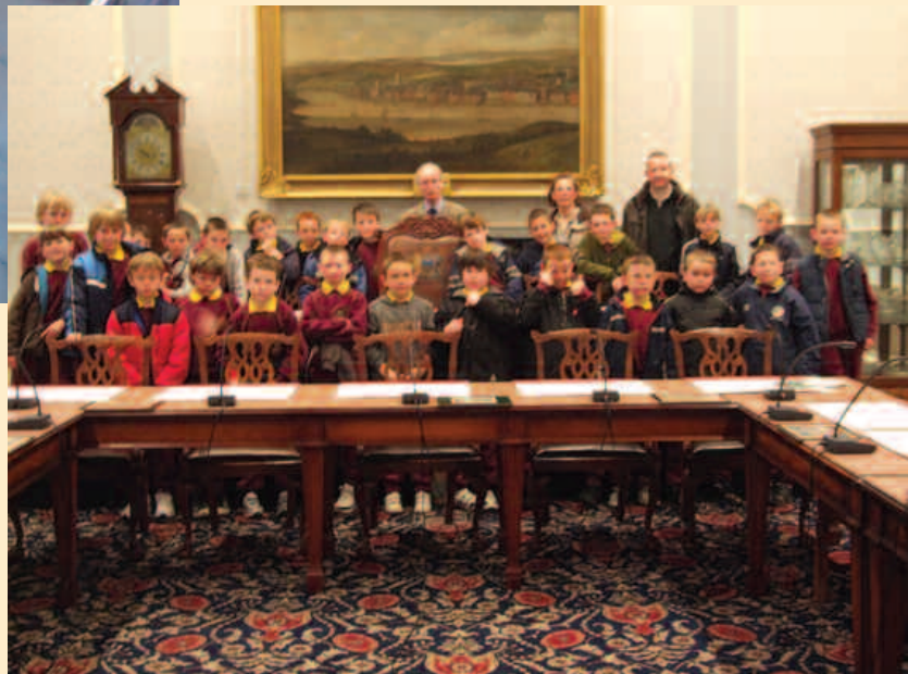
Children from St Declans school visit Waterford City Council